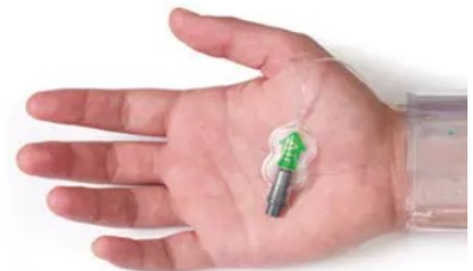
Typical radial artery compression band after procedure